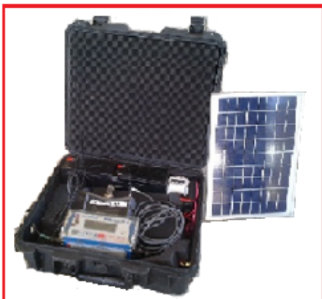
Small portable waterproof case for use in areas with limited space

Events and records are automatically sent to a client's email and stored permanently for access anywhere in the world