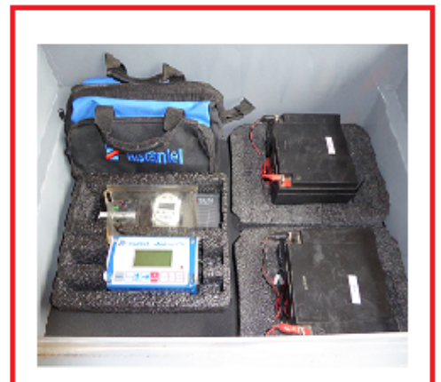
Each monitor comes equipped with everything needed to function remotely indefinitely

Please don't hesitate to contact us with any questions or comments.