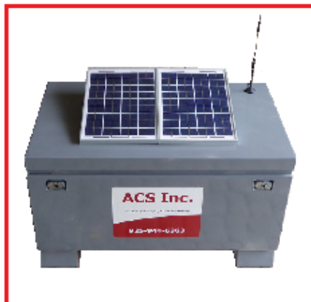
Secure Heavy duty case suitable for long term projects in any weather