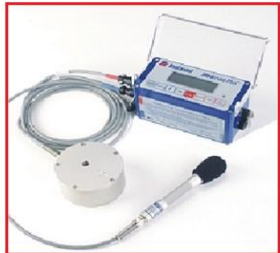
InstanTel Minimate Plus Monitor with Geophone and Microphone

ACS, Inc. uses InstanTel Micromate and Minimate Plus monitors with triaxial geophones. Each monitor can be set to record the largest vibration level during repeating intervals which can range from 2 seconds to 15 minutes and can be programmed to report when vibrations exceed a certain level in any of its three channels. Monitors can also be equipped with strobe lights and horns to provide an alert whenever an exceedance level is triggered.